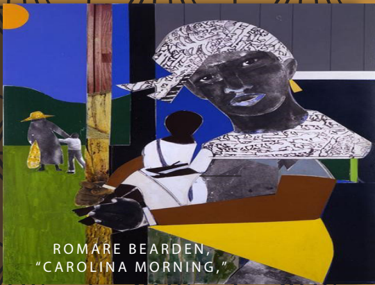
ROMARE BEARDEN, "CAROLINA MORNING,"

516 EAST MAIN STREET ELIZABETH CITY, NC 27909