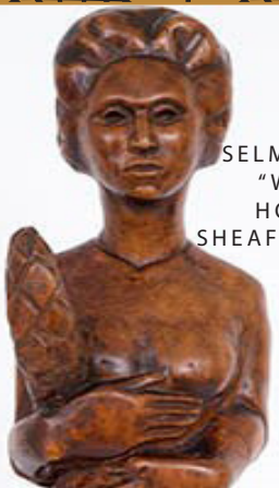
SELMA BURKE, "WOMAN HOLDING SHEAF OF WHEAT"